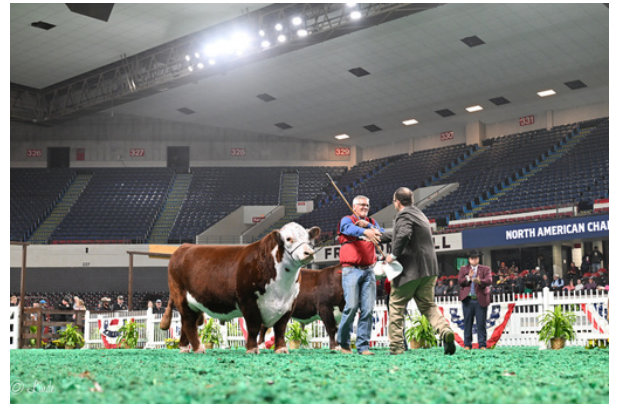
Reserve Champion Hereford Bull