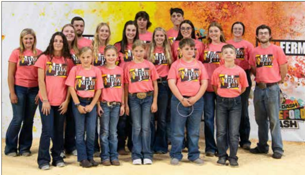
The JNHE is a continuous process for the MJHA, from raising funds together, to attending together.