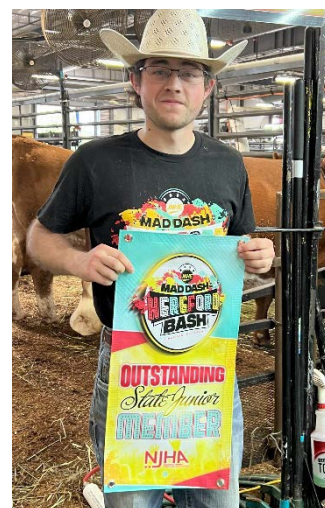
MARYLAND'S OUTSTANDING JUNIOR MEMBER: