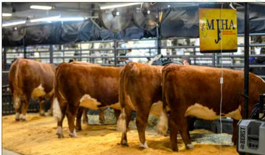
MJHA teamwork shows in all members do during JNHE, including keeping their stalls in pristine condition.