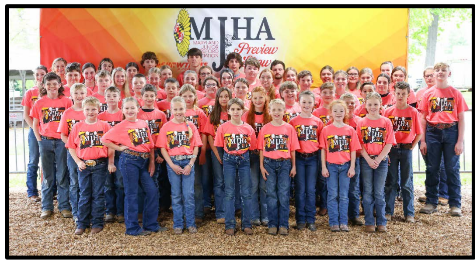
Preview Show Exhibitors