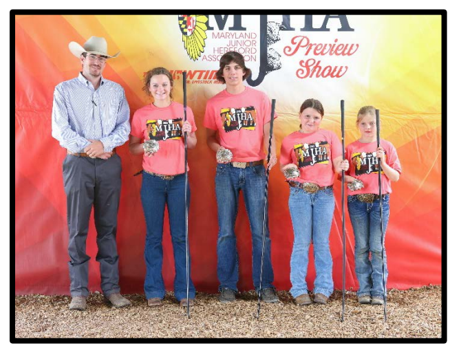
Showmanship Contest Champions