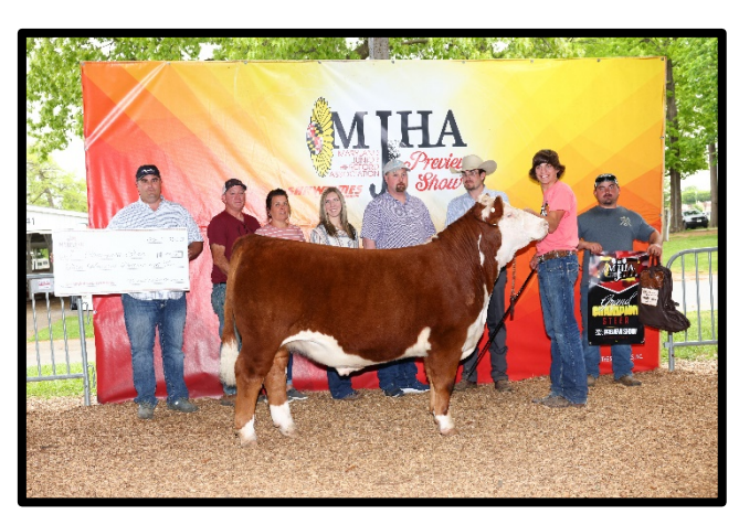
Champion Maryland Hereford Breeders Cup Steer: FDE Whiskey Sour 2207

8 steers were entered in this year's Maryland Hereford Breeders Cup program.