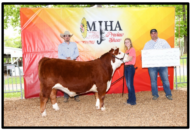
Reserve Champion Maryland Hereford Breeders Cup Steer: GGSC Arlo 71K ET