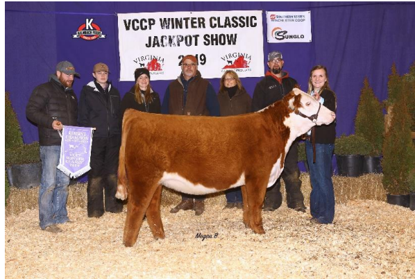
Brookwood WAM Taylor 809