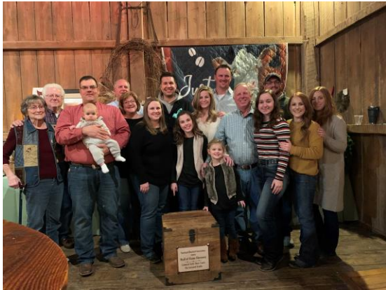
Hall of Fame Inductee- Grimmel Girls Show Cattle