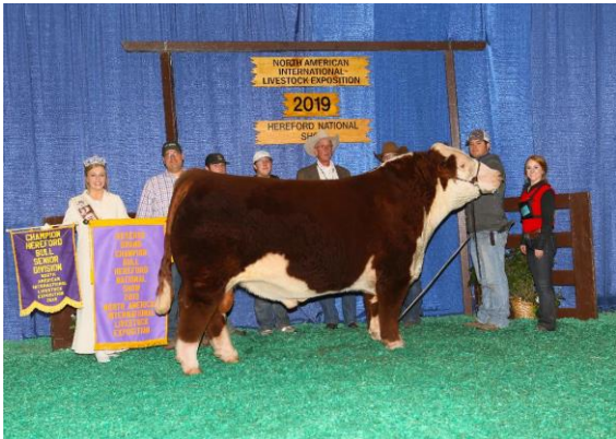
RW KLD Ruger 109 7029 ET Reserve Grand Champion Bull 2019 NAILE National Hereford Show

Owned by: Kyle Lemmon, Grimmel Girls Show Cattle, Rockin' W Ranch